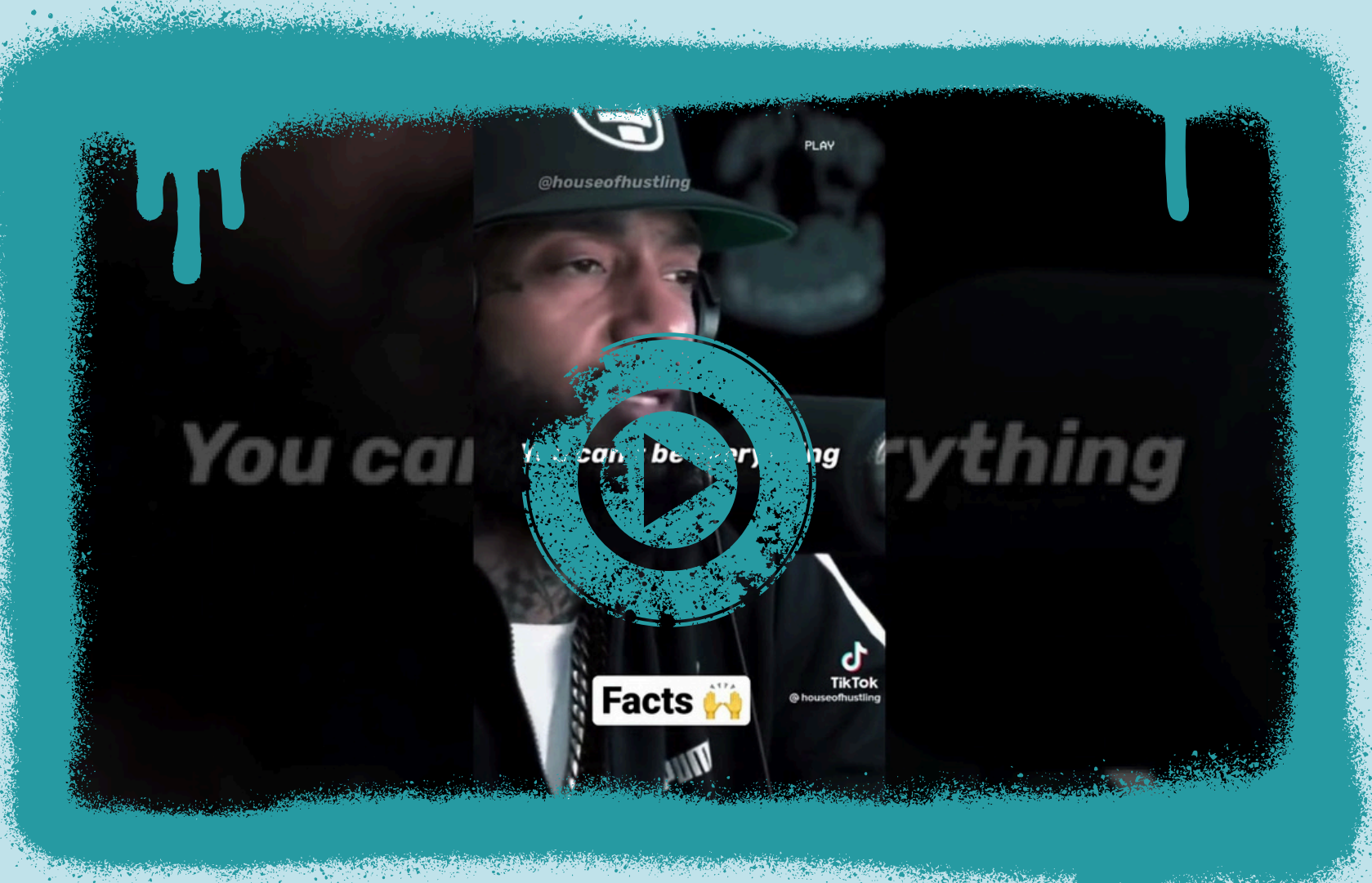
"Nipsey Hussle - Be Yourself"