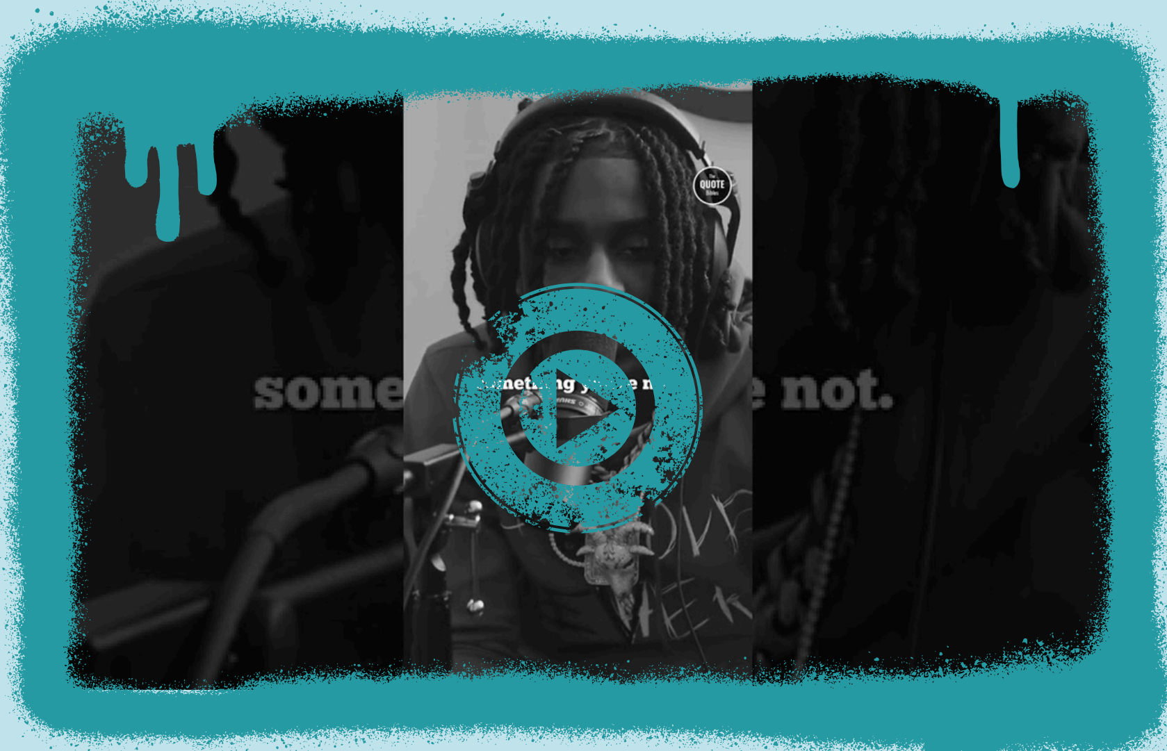
"Polo G - Be Yourself"